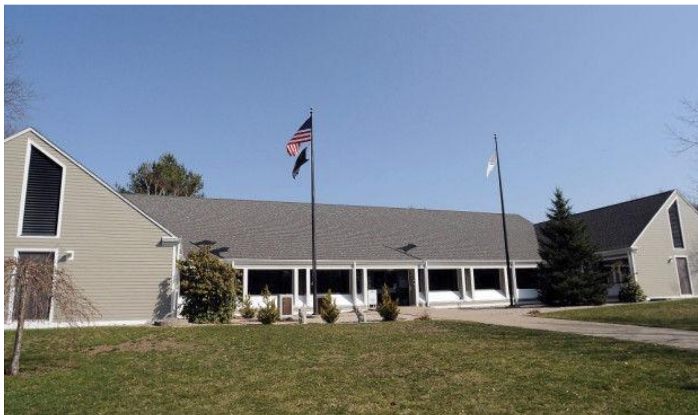
Seekonk Town Hall